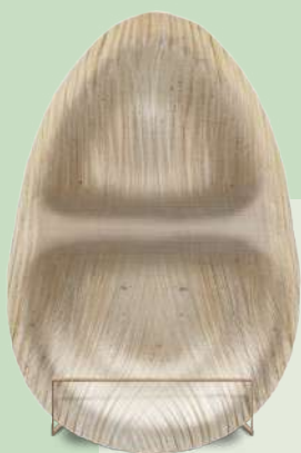
Duo Harmony (oval)