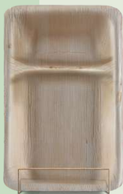
Duo Harmony (Rectangle)