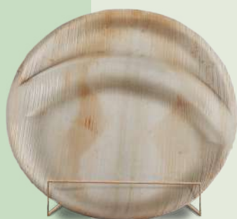
Duo Harmony (Round)